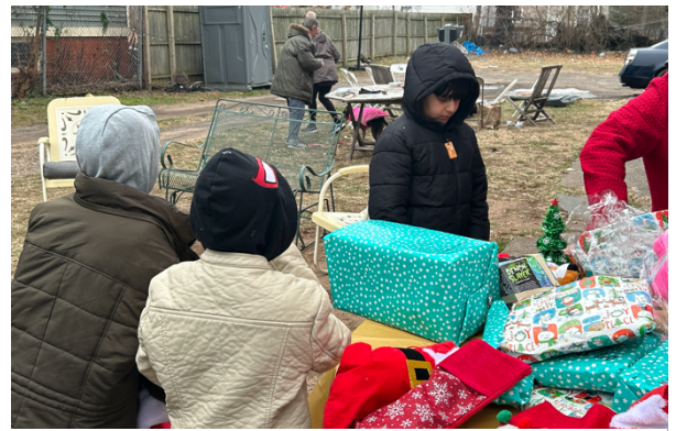
Kids Christmas Eve—presents, a campfire, and they still listened to a chapter and asked reading comprehension questions.