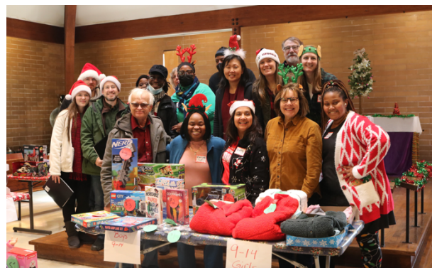
The annual Hill Christmas Store and our crew of servants—this store provides new items for Children at 85% off. This provides an affordable opportunity to buy their kids and grand-babies a few items that still cost them something—skin in the game as it were. This is not a toy giveaway.

We are so grateful for everyone who partners with us to make these ministries happen each week. Continue to pray that God uses us to minister to our Hill neighbors so that they would be drawn to follow Jesus. Thank-you.