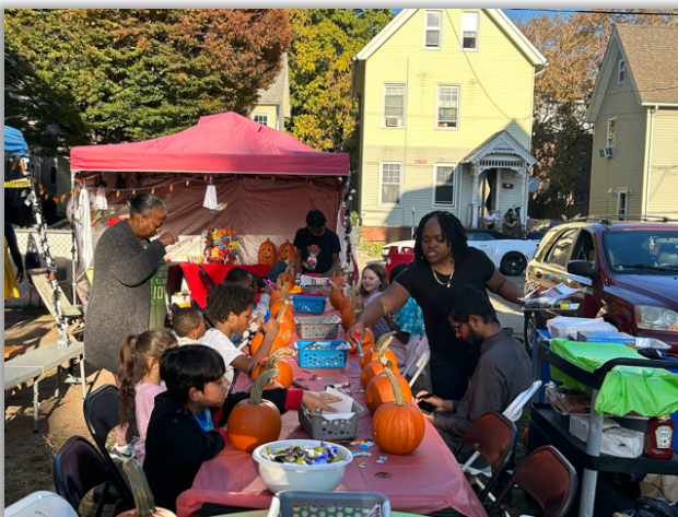
Back in the Fall at our Final Movie Night of the Season, we had a Halloween Harvest Night for the Kids.