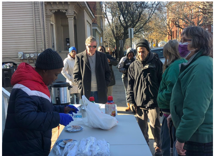
Our 5 th annual Sidewalk Thanksgiving—served over 35 folks a thanksgiving meal with all the trimmings.