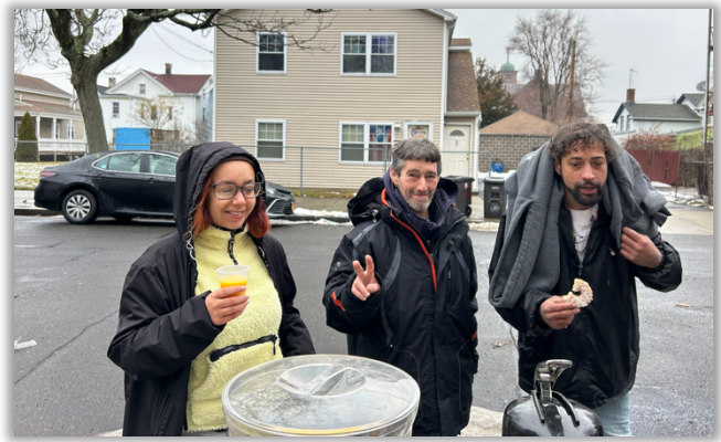
Wednesday Coffee & Conversations, a space for Hill folks to spend time with a pastor; using this time and space for some good conversations, which happen every Wednesday—and prayers with folks, too.