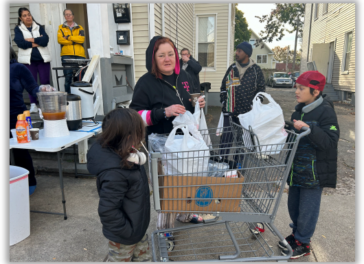
Kids often come to our Saturday Sidewalk Breakfast & Church. In fact, kids love to hold our Call to Worship. This is such an opportunity for reaching Hill children—we're praying someone steps up to start a kids Saturday Sidewalk Ministry—a Sidewalk Church "Sunday School" if you will. Will you pray God brings this to pass?