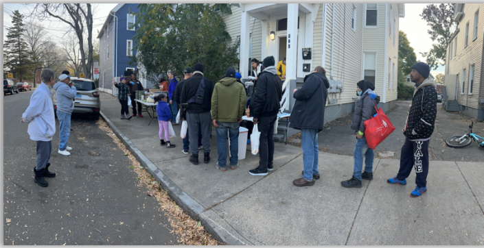
One of the reasons I do open air preaching: it is the more likely way of reaching men—seems to be working here on Saturdays. Most of the 35-40 who come are men.