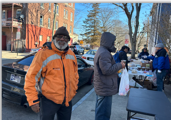
The gentleman in the orange jacket is a regular—a Christian man, who, with his wife, regularly attends our Sidewalk Church—they consider it their church.