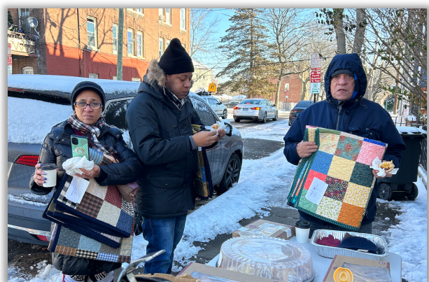
One of our wonderful supporters makes hand-made blankets for our Wednesday & Saturday guests.